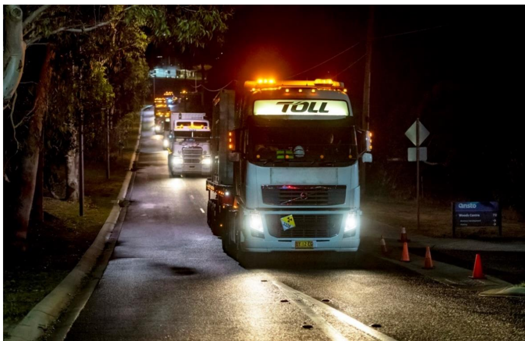
Figure 3 Transport of used OPAL reactor spent fuel (2018)