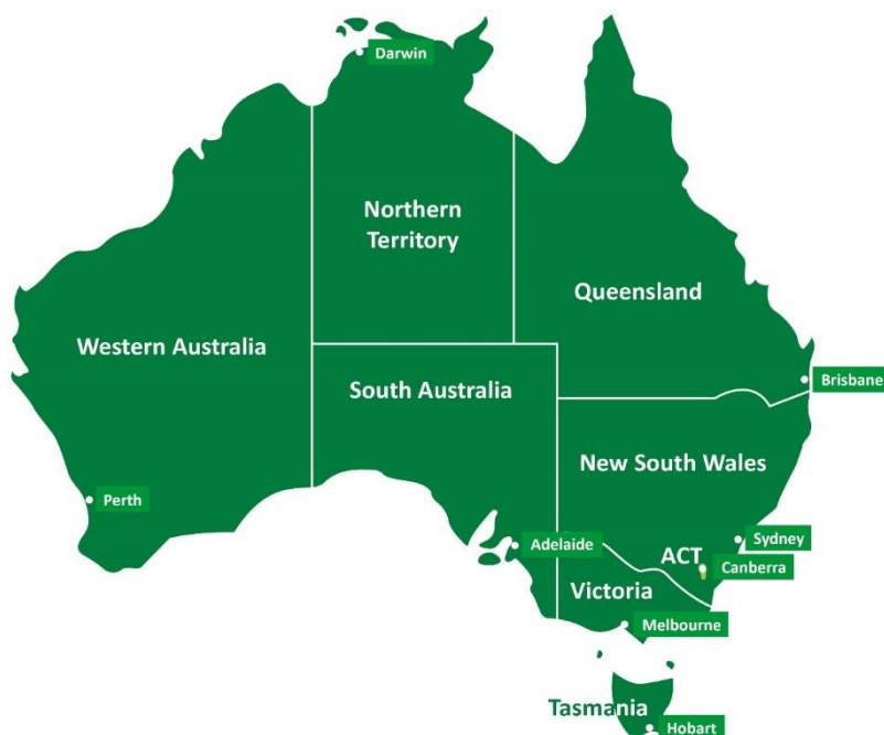
Figure 1 Map of Australia showing states and territories

Australia is a federation of nine jurisdictions (