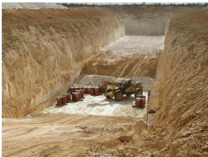
Figure 4 The Mt Walton East Intractable Waste Disposal Facility in Western Australia

The disposal of radioactive wastes at the Mt Walton East IWDF in Western Australia (Figure 4) has been regulated by the radiation regulator since 1992. The site was chosen based on criteria in the IAEA publication, Site Investigation for Repositories for Solid Radioactive Waste in Shallow Ground, Technical Report Series No. 216 (1982). All aspects of the design, operational requirements, duties and responsibilities must comply with the Western Australian legislation and the near-surface disposal code (NHMRC, 1992). Work is currently underway to transition to requiring compliance with RPS C-3 which has replaced the Code of practice for the near-surface disposal of radioactive waste in Australia (1992) (NHMRC 1992). Radiation monitoring at the disposal facility is carried out in accordance with documented requirements given by the regulator. Measurements include absorbed dose rates in air, radon concentration in air, radionuclide concentrations in water, and pre- and post- disposal measurements. Personnel monitoring is carried out during a disposal campaign.