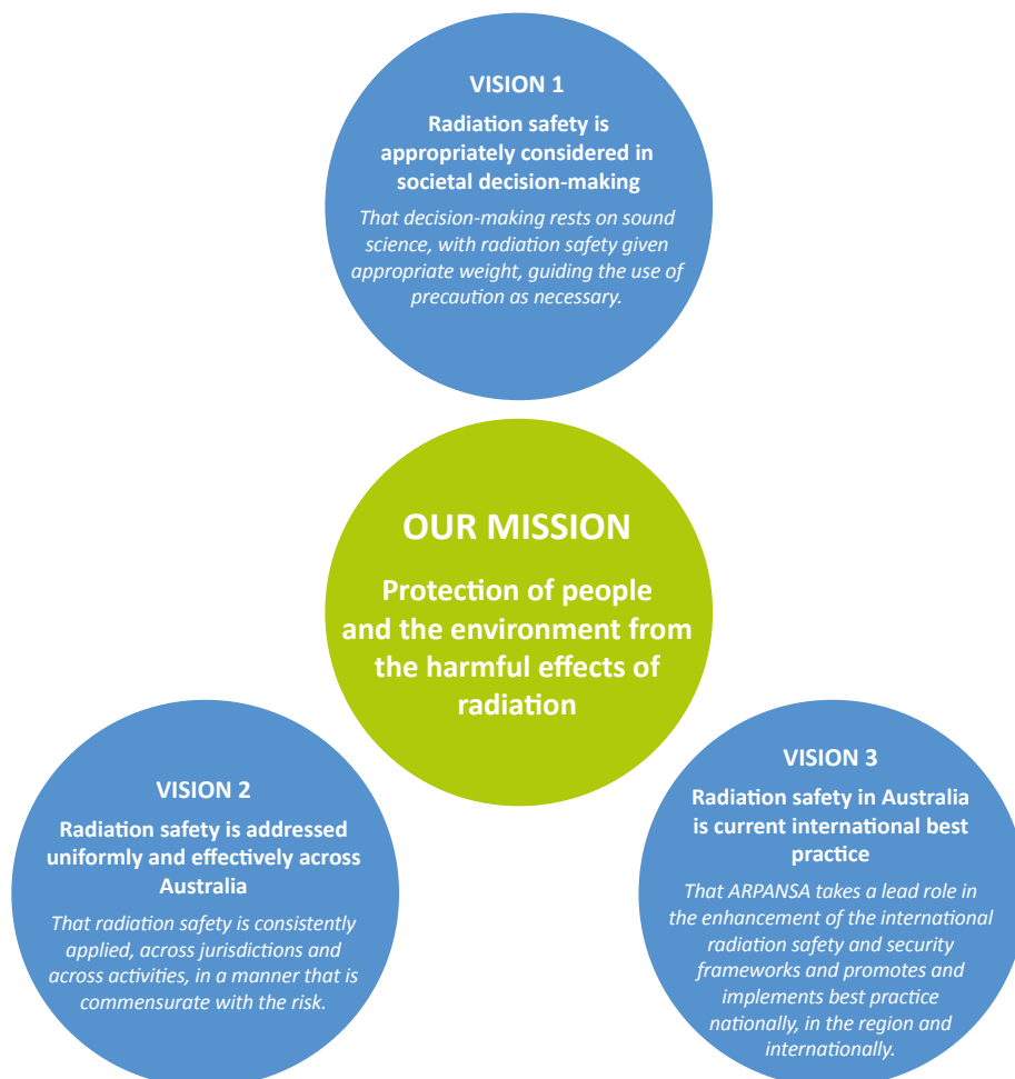
Figure 2: Our mission and vision

Our regulatory role is implemented through the ARPANS Act and our regulatory and advisory frameworks are based on monitoring of levels of radiation in the environment and scientific evidence regarding the effects of radiation on human and environmental health and wellbeing.