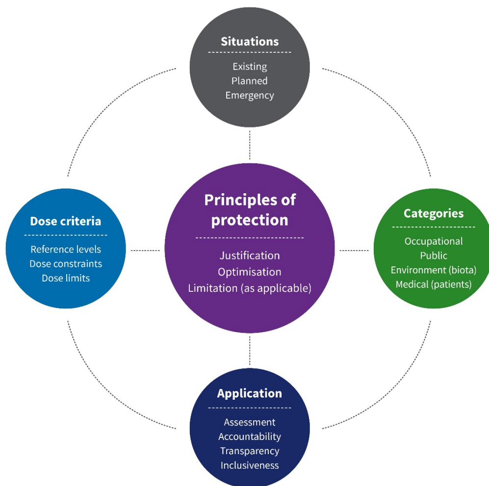
Figure 2.1: The system of radiological protection illustrating the interrelationships of the principles of protection, the exposure situations, the categories of exposure, the dose criteria, and the application for implementation of the system.