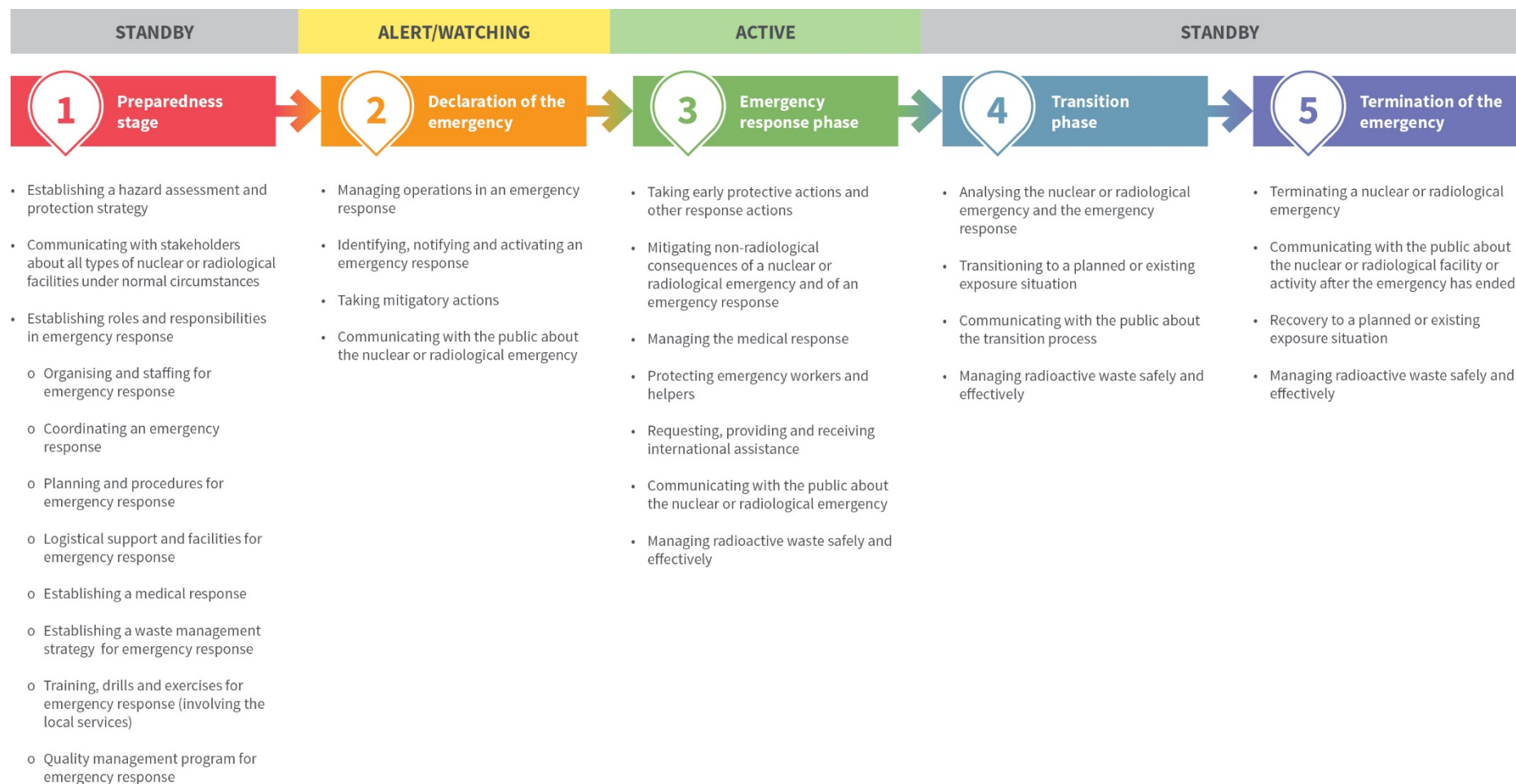
Figure 2.3: Phases of an emergency exposure situation as documented in this guide and an example of their alignment with phases of an emergency response plan.